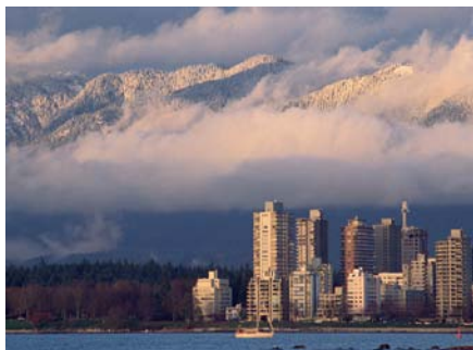
Tourisme Vancouver / Andy Mons